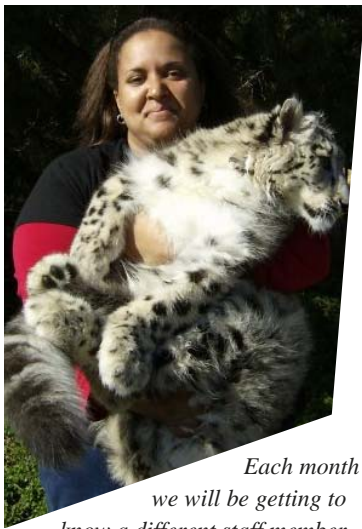
Each month we will be getting to know a different staff member.