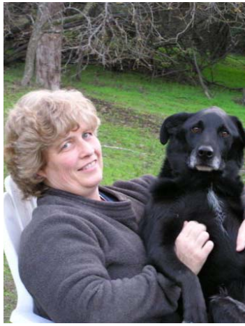
Miss Kitty or Miss Garage Kitty.

What kind of pets do you have? Currently I have 4 dogs and 2 cats. My oldest is sort of a Min Pin-a-huahua that came from NorCal Aussie as a foster and he's about 18 or 19 now. Rollins, the Akita/GSD or malinois mix, is around 11 or 12 now. Piper, the Border Collie mix is about 7 now. Then there's little Millie the chi mix who is also from here – another failed foster. Cats – Coco who came to me from the shelter and a cat I inherited from the neighborhood who answers to